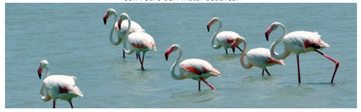
Flamingos in San Pedro del Pinatar Natural Park