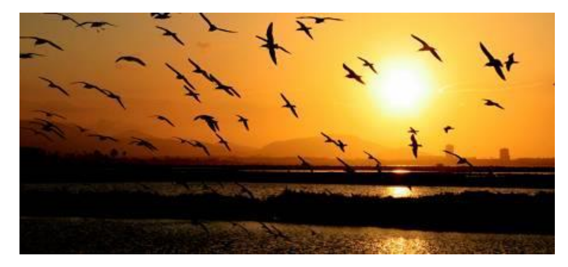
Las Salinas Natural Park.