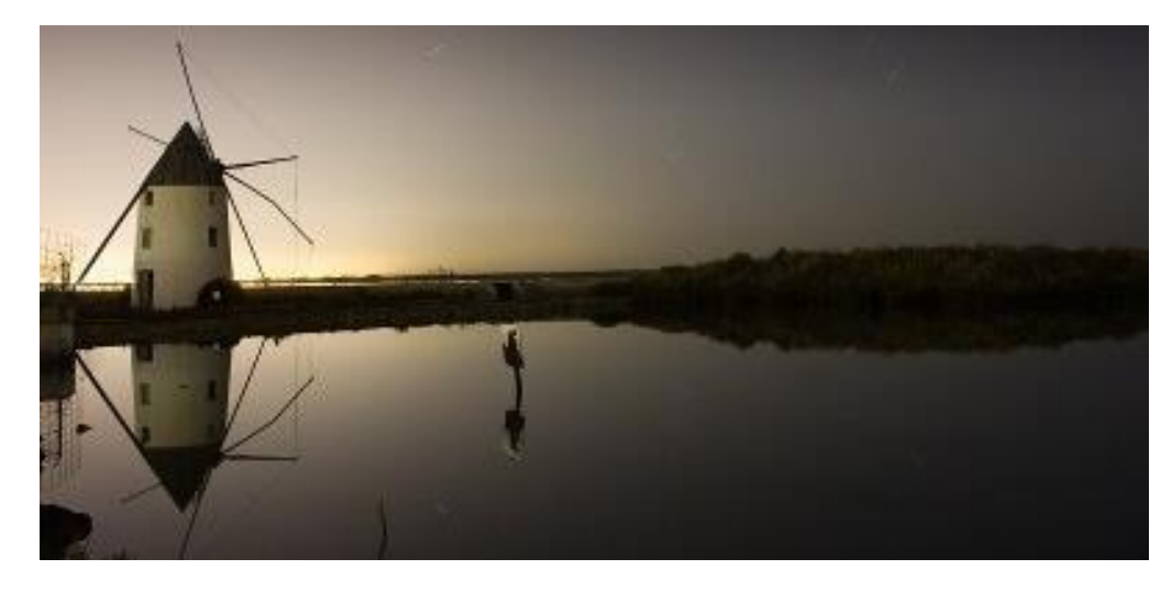
Mill from San Pedro del Pinatar.