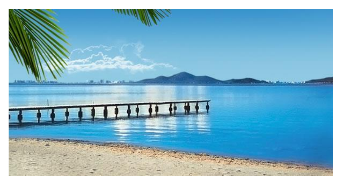
San Pedro del Pinatar beaches.