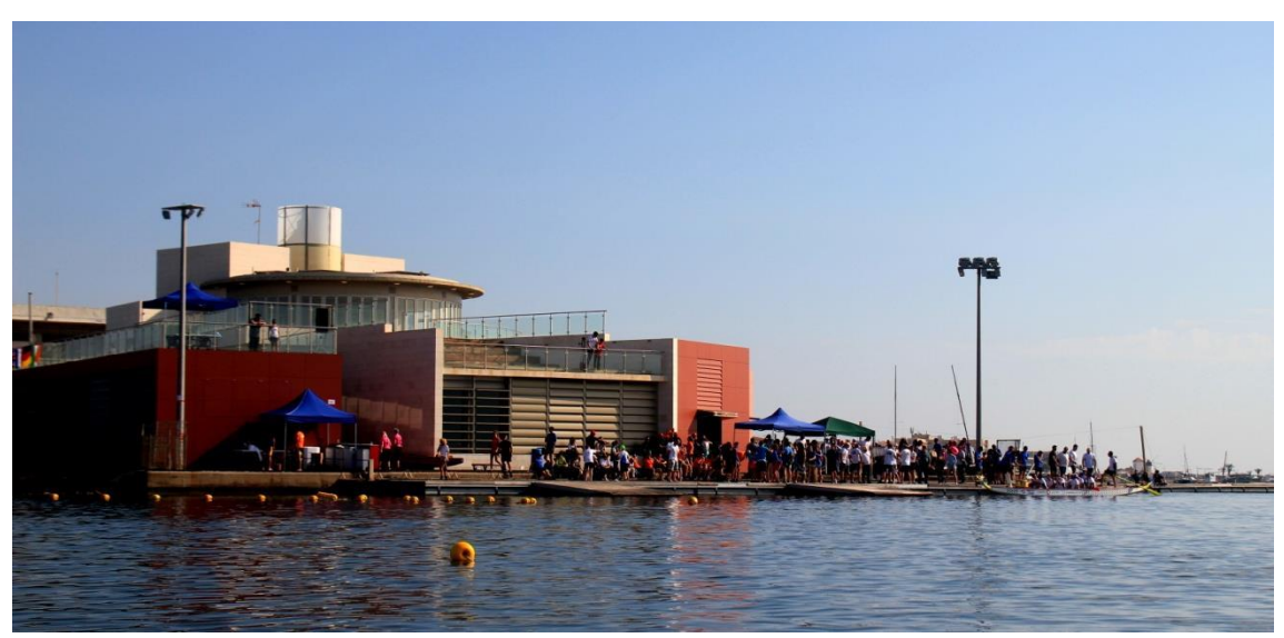
Water Sport Centre of San Pedro del Pinatar