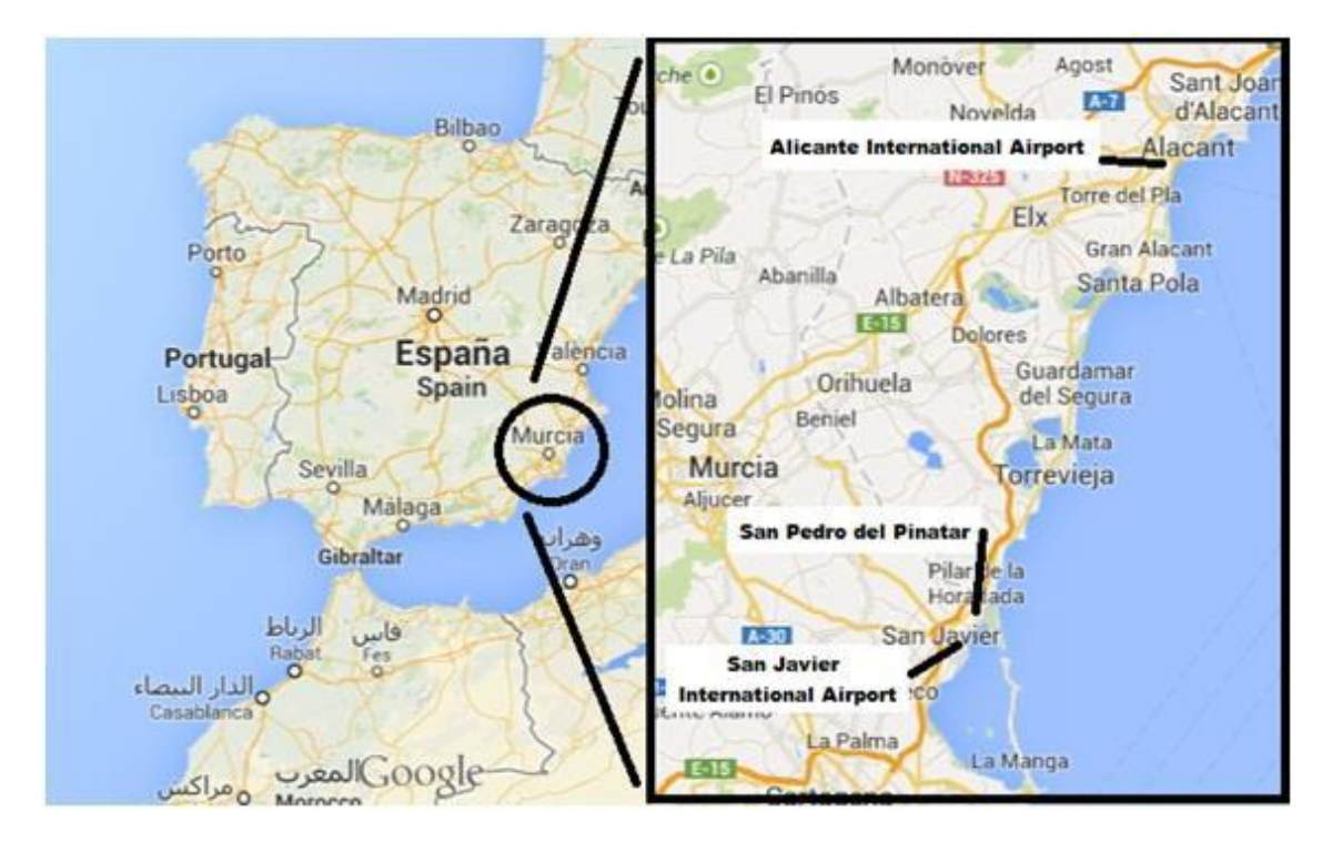
Asociación Deportiva Pinatarense location